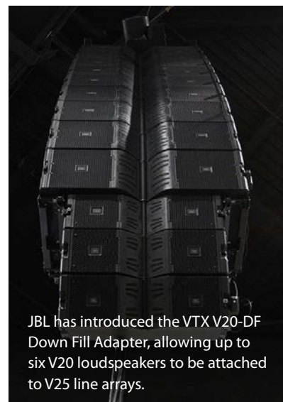
JBL has introduced the VTX V20-DF Down Fill Adapter, allowing up to six V20 loudspeakers to be attached to V25 line arrays.